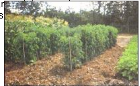
Wait until temperatures have warmed to apply an organic mulch around your plants.

LOTS OF SUNLIGHT Wanna know the secret of tasty tomatoes and productive plants? In a word, it is sunlight. Sun shines on leaves enabling them to produce carbohydrates. Carbohydrates mean more fruit set and larger, tastier fruit. Less than ideal light and you get less than ideal production and quality. You cannot make up for a lack of sunlight with water, fertilizer or hope.