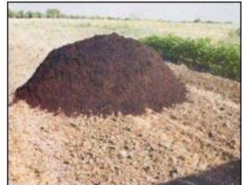
Apply liberal amounts of organic matter for top tomato production.

Tomatoes can also be grown in containers. Rather than using garden soil, select a quality soilless potting medium as these allow for optimum root growth, soil moisture retention and nutrient availability. Containers should be a minimum of 5 gallons per plant although larger is better. Be ready to be more diligent with watering and fertilizing as a container grown plant has a very restricted root system.